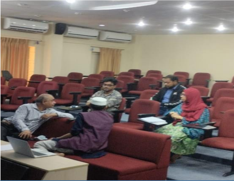
Meeting at virtual seminar room of RUET