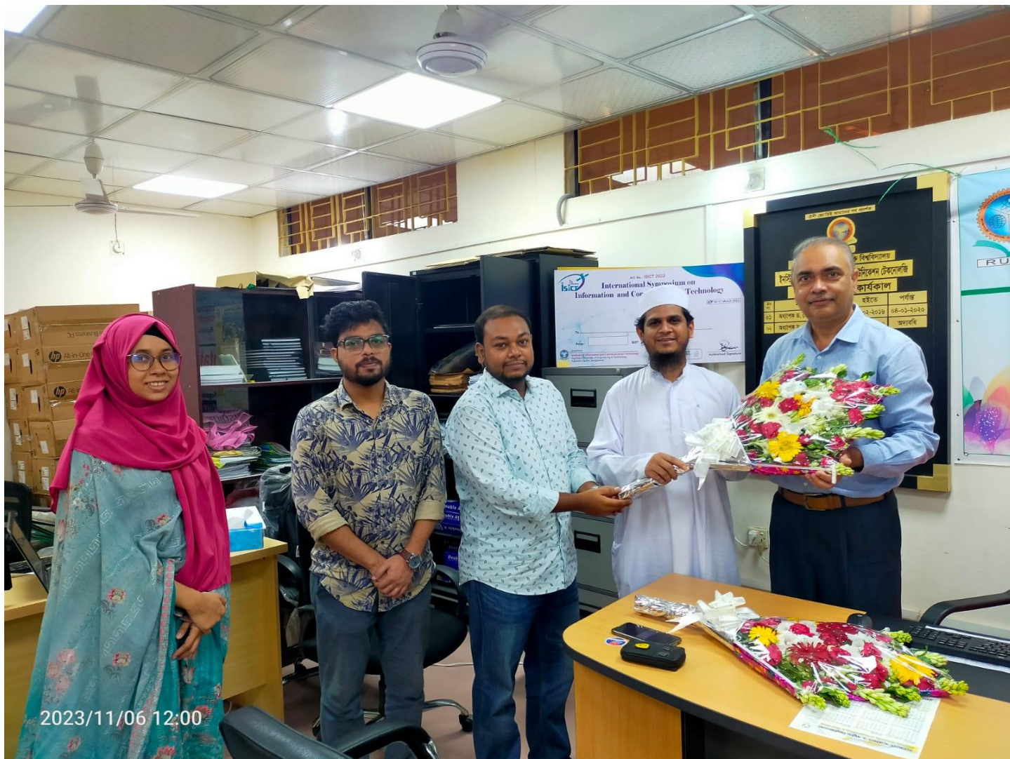
IICT teachers welcome their new director

of the department of Computer Science and Engineering, RUET from 2006 to 2011. He served as an Additional Director in Institutional Quality Assurance Cell (IQAC), RUET as well as served as Director of Institute of Information and Communication Technology, RUET. He published more than 40 journal/conference papers. He served as an Organizing Chair, a PC member, reviewer and sub-reviewer for many Journals and Conference. He is an IEEE member and IEB fellow. He is interested in programming with C/C++, C#, Java, JavaScript, HTML, CSS, and Python. IICT teachers welcome the new director with a flower bouquet. They also thank the ex-director for his successful carrier at IICT.